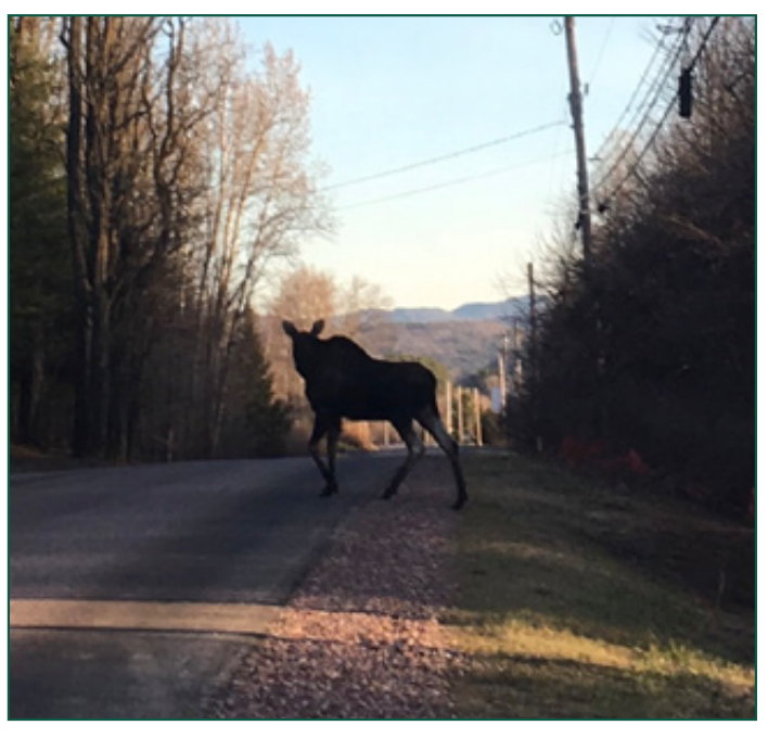
A moose crossing Route 100 in the Shutesville Hill Wildlife Corridor