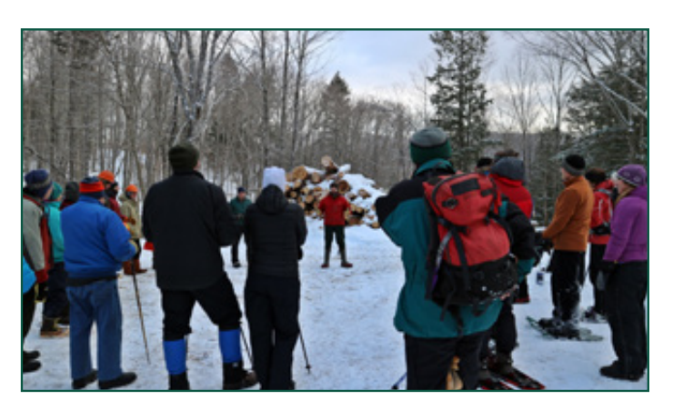
Community members attended a Forestry Walk this winter in the Shutesville Hill Wildlife Corridor

Exciting news from the Shutesville Hill Wildlife Corridor Partnership! High Meadows Fund has awarded the partnership $42,000 for outreach efforts to engage local landowners and community members in this important wildlife corridor project. The partnership aims to protect the link from the Green Mountains, across Route 100, to the Worcester Mountains, enabling wildlife to travel between the two. Stowe Land Trust is working with many partners on this effort, including The Nature Conservancy, Vermont Land Trust, the State of Vermont, and the Stowe and Waterbury Conservation Commissions. We hope you can join us for one of our upcoming SHWC community events this spring and summer.