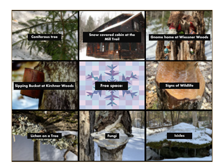
Looking for more scavenger hunt fun? Try completing this winter hunt before spring!