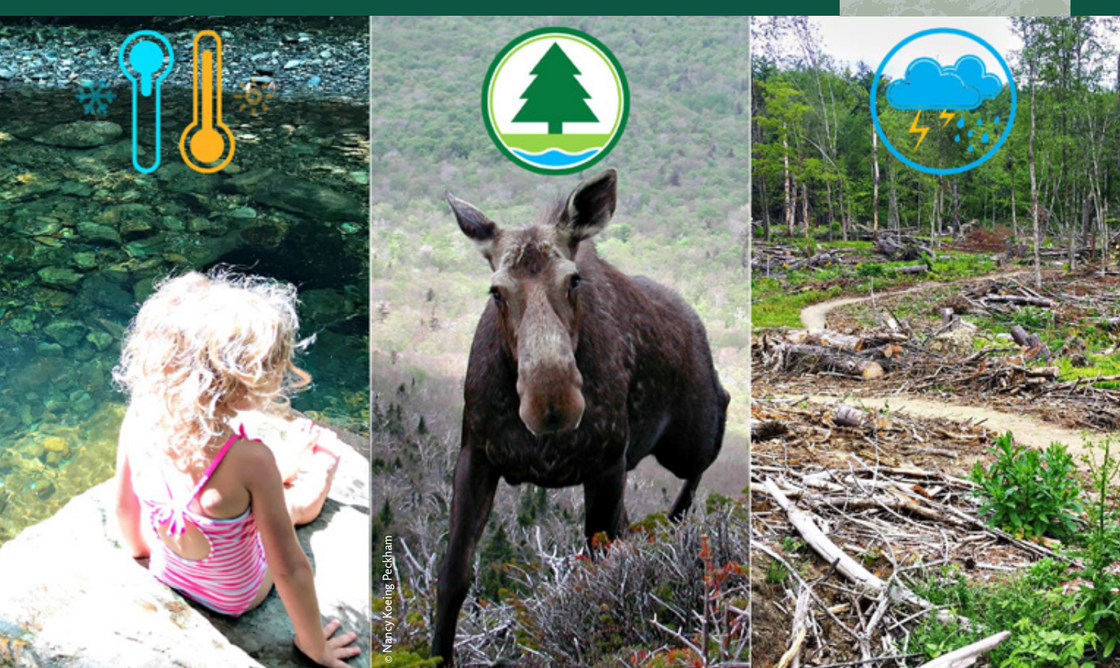
Cooling Off by the West Branch of the Little River, Moose on the Move, Cady Hill Forest Reopened After October 2017 Windstorm

In This Issue Our Donors SLT Updates Outings Calendar