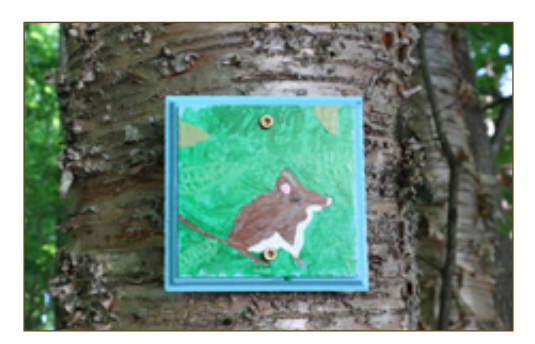
One of the new trail markers guiding the way up to Sunset Rock.

In the spring of 2018, Stowe Land Trust partnered with 4th graders at Stowe Elementary School to create the beautiful trail markers guiding the way up Sunset Rock. The kids were tasked with painting a plant or an animal that visitors might find on the trail. The plaques serve as both a guide to show hikers the path, and a fun way to learn about the environment around us.