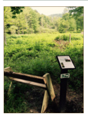
Learn more about this multiyear effort to restore DuMont Meadow by checking out the informational signs along Alex's Trail.

DuMont Meadow has about 1400 fewer invasive bush honeysuckle plants and 550 more native trees and plants than it did two years ago. The meadow's been brushhogged and the area along the Little River is being allowed to grow back up into a floodplain forest. All this work to restore the wildlife habitats and native ecosystems on this special property was done without the use of herbicides thanks to support from the Oakland Foundation, the Davis Conservation Foundation. Intervale Conservation Nursery, AJ's Ski & Sports and Patagonia, and dozens of volunteers.