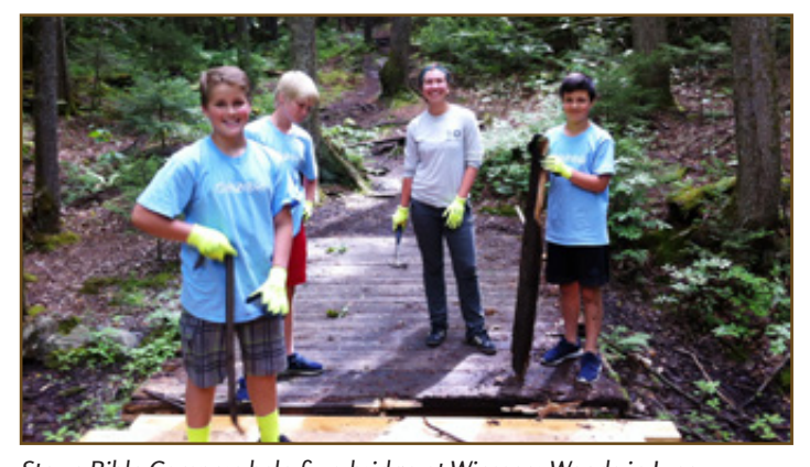
Stowe Bible Campers help fix a bridge at Wiessner Woods in June.

Thanks to help from our great volunteers, Stowe Land Trust's trails got some love this summer. Stowe Bible Camp and Stowe Mountain Resort Adventure Camp helped to replace the decking on two bridges at Wiessner Woods. National Life Group volunteers opened up a new footpath at the Burnham Farm in May. We also got lots of help from our Volunteer Land and Trail Stewards and local summer camp groups doing general maintenance throughout the season. Thanks everyone!