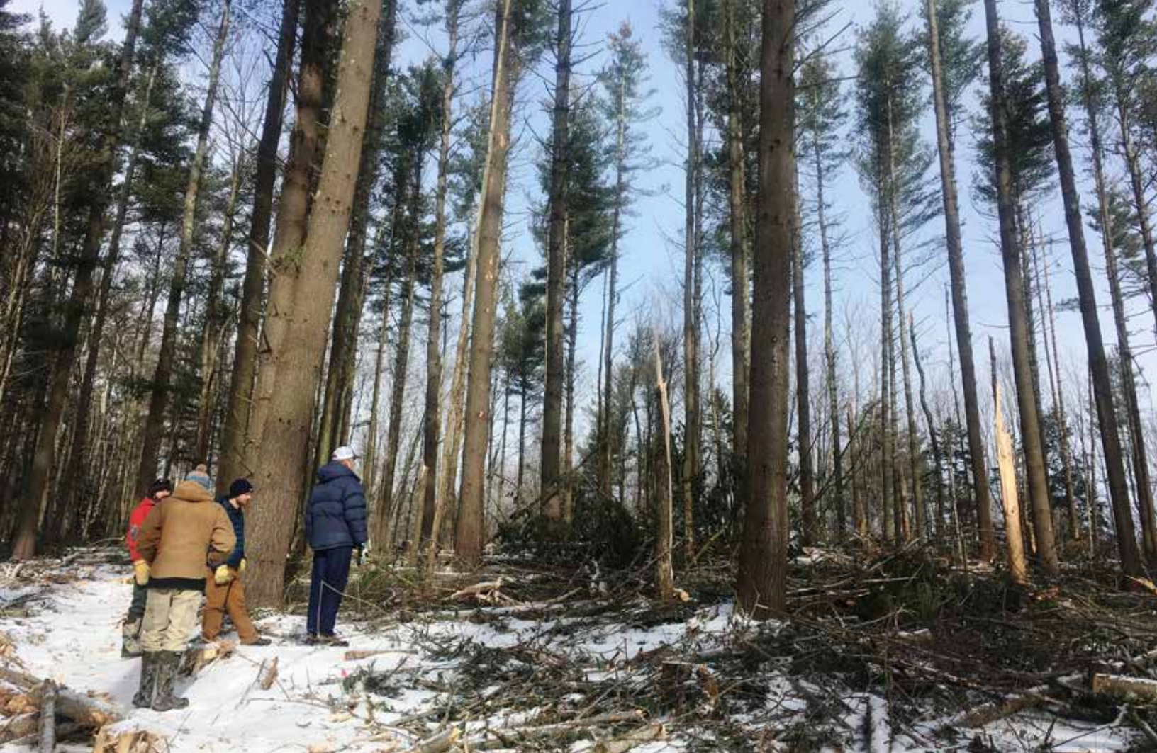
Above: Surveying a post-storm harvest at Cady Hill, 2018.