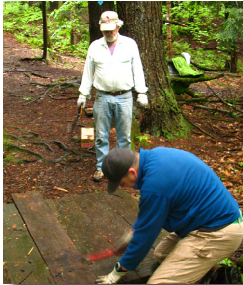
Volunteers at the Wiessner Work Day.

In addition to trail improvements this summer, visitors to the property will soon see an updated trail map and new trail signs with the iconic owl that has stood watch over these woods for so long.