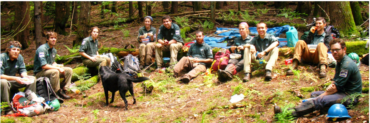
YVCC crew leaders in training - taking a break from replacing the Hardwood Ridge Trail bridge.