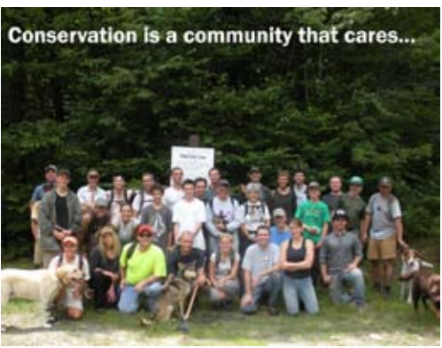
Join online or send in the enclosed remittance envelope. Thank you!

AISH STOWE LAND THUST UNLINE FOR PROJECT UPDATES, AN EVENTS CALENDAR, OR TO MAKE A DONATION