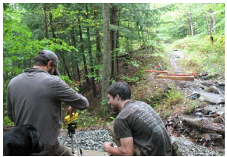
Timber & Stone trail crew at the bridge site on the Mill Trail.

plan to restore the Mill Trail Cabin so it is safe for more frequent day use and limited overnight use. Since 2010 when Cushman Design