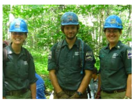
Youth Corps crews spent two weeks this summer working on the trail at Adams Camp.

Thanks to the 180+ donors listed on page three, Stowe Land Trust now has the funds in place to begin construction of the bridge this fall. The incredible support came from people from all walks of life – those who want to access the land for nature walks, those who are eagerly anticipating the new network of mountain bike trails, and those who remain hopeful that the bridge will