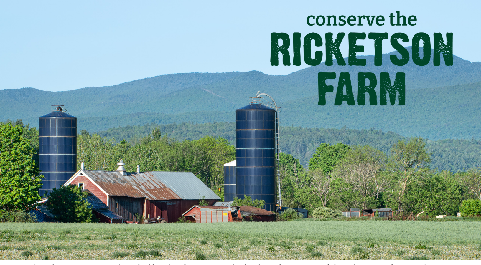
The Ricketson Farm's iconic silos and red barn have become a Stowe landmark. Read our cover story below to learn more about our efforts to protect this irreplaceable part of the town's landscape.