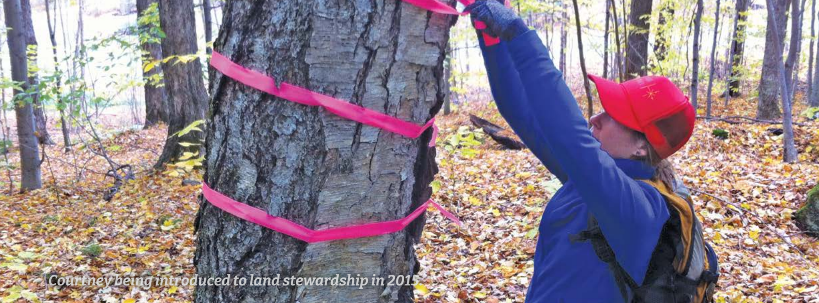
Courtney being introduced to land stewardship in 2015