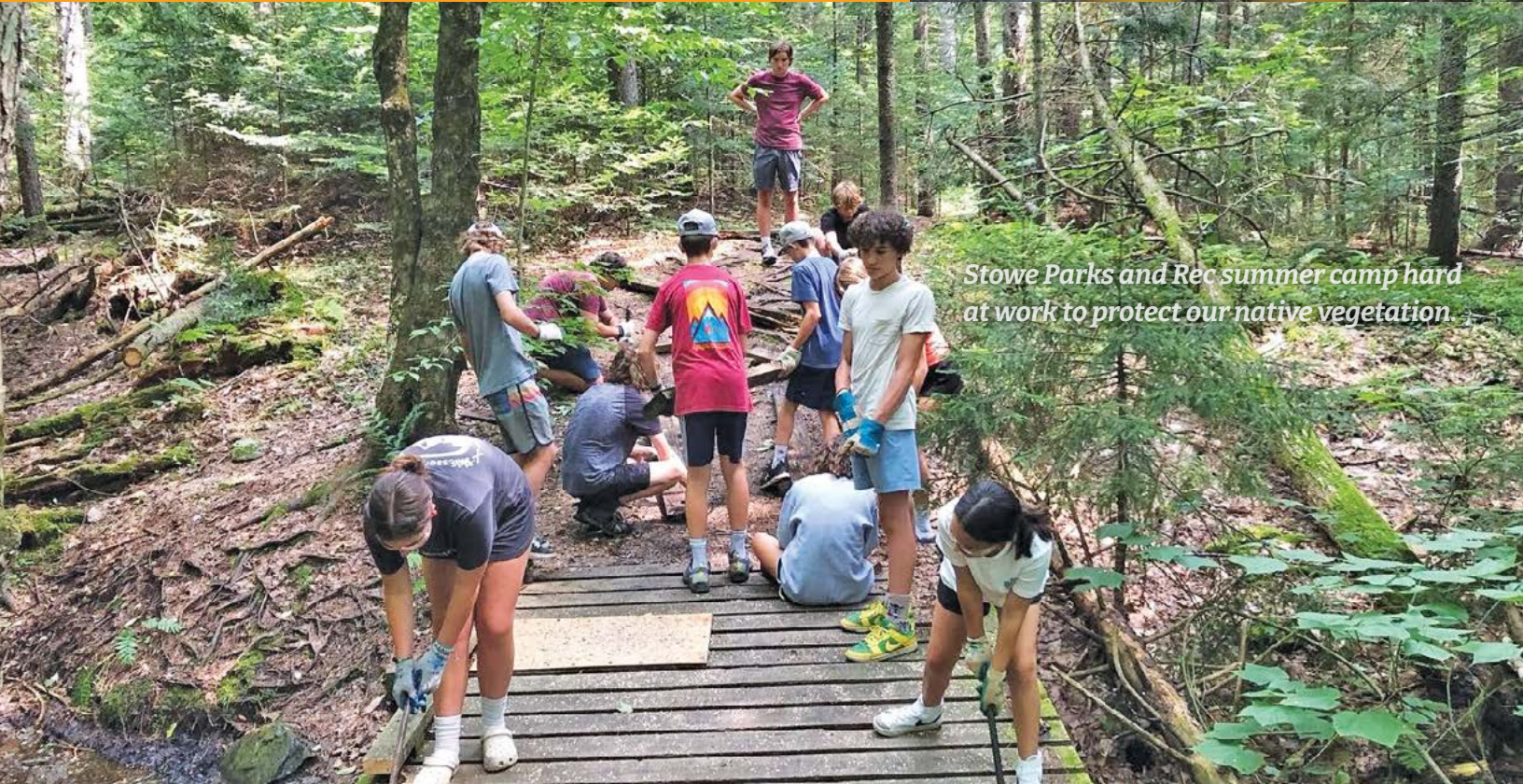
Stowe Parks and Rec summer camp hard at work to protect our native vegetation